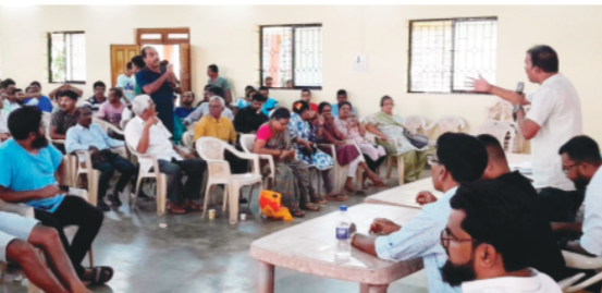
कोरगाव : ग्रामसभेत बोलताना ग्रामस्थ.